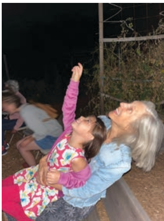
Family members enjoy stargazing at the Lafayette Community Garden